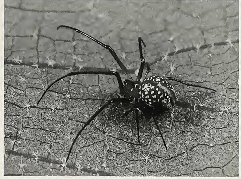
Figure 2.— Okileucauge sasakii new species, female on a leaf.

When Hormiga et al. (1995) made a phylogenetic analysis of tetragnathid spiders, 60 characters were used. Of these, 10 characters were also used in the present study (1, 4, 7, 8, 12, 13, 15, 16, 17, 18). The remaining char-